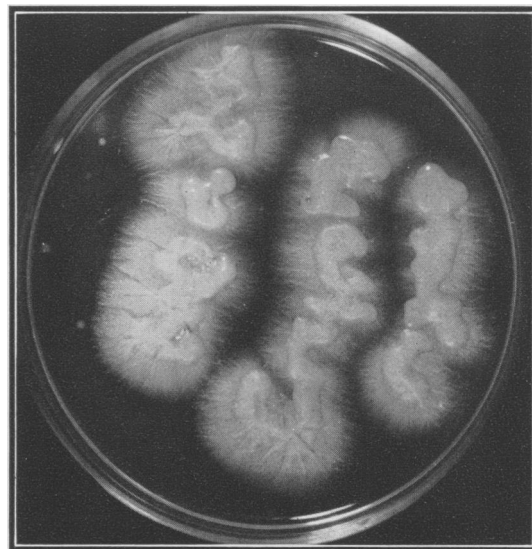
FIG. 1.—Petri dish culture, 12 days old. The central raised growth consists of the torula-like spore forms, and is of coral colour in the original. The delicate hairy outgrowth is the mycelial phase.

On asparagus agar .—Within 48 hours a small round orange-tinted colony appears with elevated glistening centre. As this gradually enlarges it becomes coral pink. A somewhat