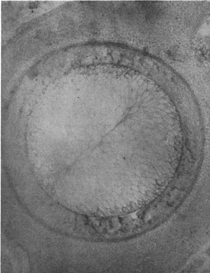
Tetanus Spores (The Universal Microscope). 25,000 \times on 35 mm. film, enlarged 227,000 \times .

at a magnification of 8,000 diameters, numerous nonmotile cocci and diplococci of a bright-to-pale pink in color were seen in hanging drop preparations of filtrates of Herpes encephalitic virus. Although these were observed to be comparatively smaller than the cocci and diplococci of the streptococcus and poliomyelitic viruses, they were shown to be of fairly even density, size, and form and surrounded by a halo. Again,